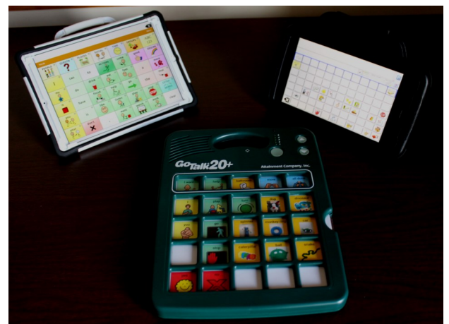
AAC options used by patients of CARD Clockwise from top left: TouchChatHD-AAC app for iPad, Accent 800, and Go Talk 20+