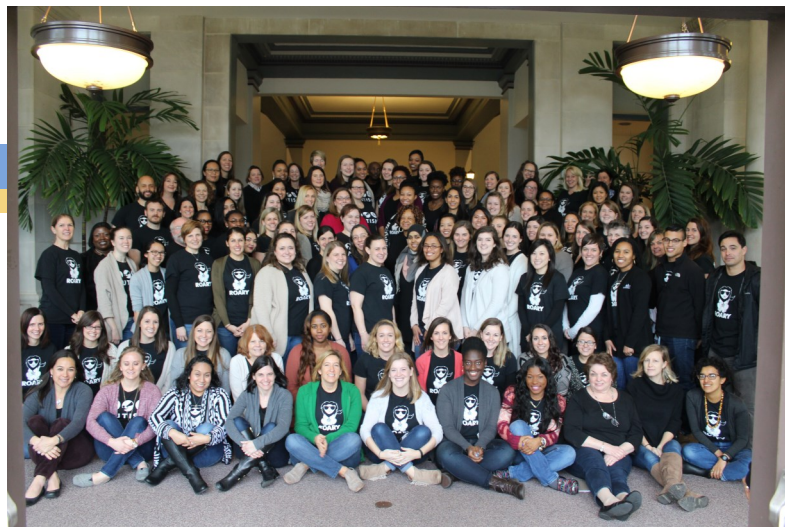
CARD Staff enjoyed a creative and productive retreat in January.