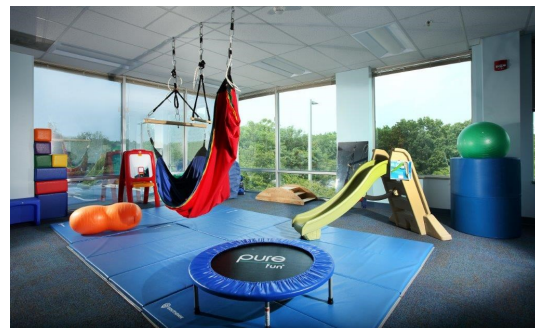
Odenton's Occupational Therapy Gym